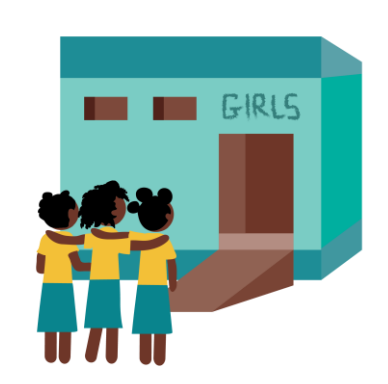
386 washrooms for girls for MHM