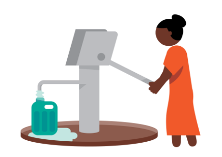
423 water points